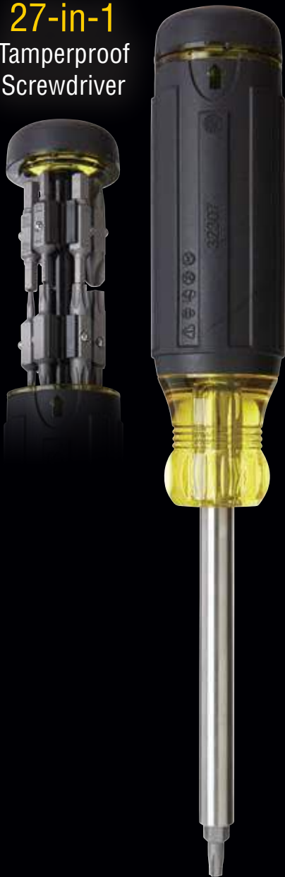
27-in-1 Tamperproof Screwdriver