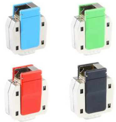
Jewel Backshells for D-Sub Connectors

Jewel Backshells for FCT D-Sub Connectors offer cable management by enabling a straight to 45-degree adjustment of the d-sub connector's orientation and provide click-and-close assembly, protection and strain relief