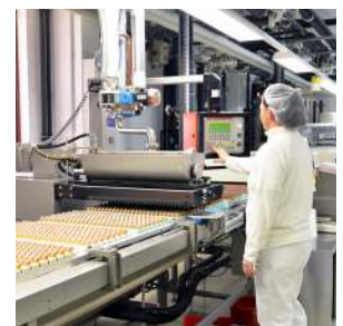
Food and Beverage Equipment