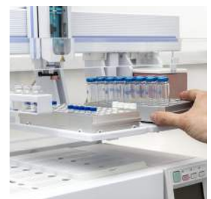
Test and Measurements here