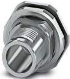
Housing screw connection, PlugLink:M12-SPEEDCON, Rear mounting, M15 x 1

Please be informed that the data shown in this PDF Document is generated from our Online Catalog. Please find the complete data in the user's documentation. Our General Terms of Use for Downloads are valid ( http://phoenixcontact.com/download )