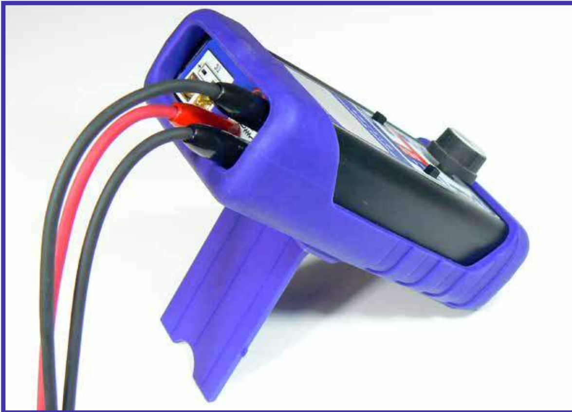
Flip out stand for bench use