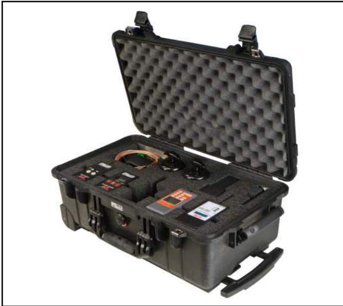
Figure 1. SCS 751 EOS/ESD Audit Kit, Standard