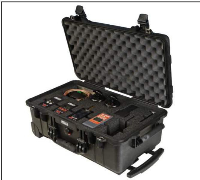
Figure 2. SCS 752 EOS/ESD Audit Kit, Premium