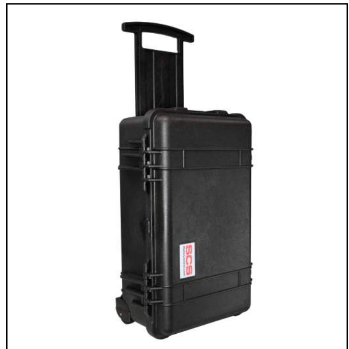
Figure 3. Extendable handle on the carrying case