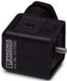
Valve connector, 3-pos., type B, unconnected, screw connection, cable screw connection Pg9

Please be informed that the data shown in this PDF Document is generated from our Online Catalog. Please find the complete data in the user's documentation. Our General Terms of Use for Downloads are valid ( http://download.phoenixcontact.com )