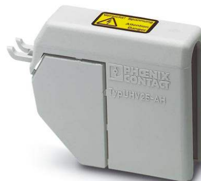
Illustration shows the product version UHV 25-AH

http://eshop.phoenixcontact.de/phoenix/treeViewClick.do?UID=2130473