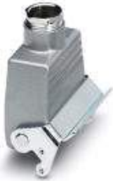
Coupling housing, with single locking latch, height 48 mm, with screw connection, 1x Pg16

Please be informed that the data shown in this PDF Document is generated from our Online Catalog. Please find the complete data in the user's documentation. Our General Terms of Use for Downloads are valid ( http://phoenixcontact.com/download )