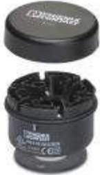
Connection element with screw connection terminal blocks for base mounting

Please be informed that the data shown in this PDF Document is generated from our Online Catalog. Please find the complete data in the user's documentation. Our General Terms of Use for Downloads are valid ( http://phoenixcontact.com/download )