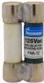
125Vac 12 to 15A