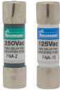
250Vac 1/10 to 6A 125Vac 6-1/4 to 10A