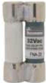
32Vac 20 to 30A