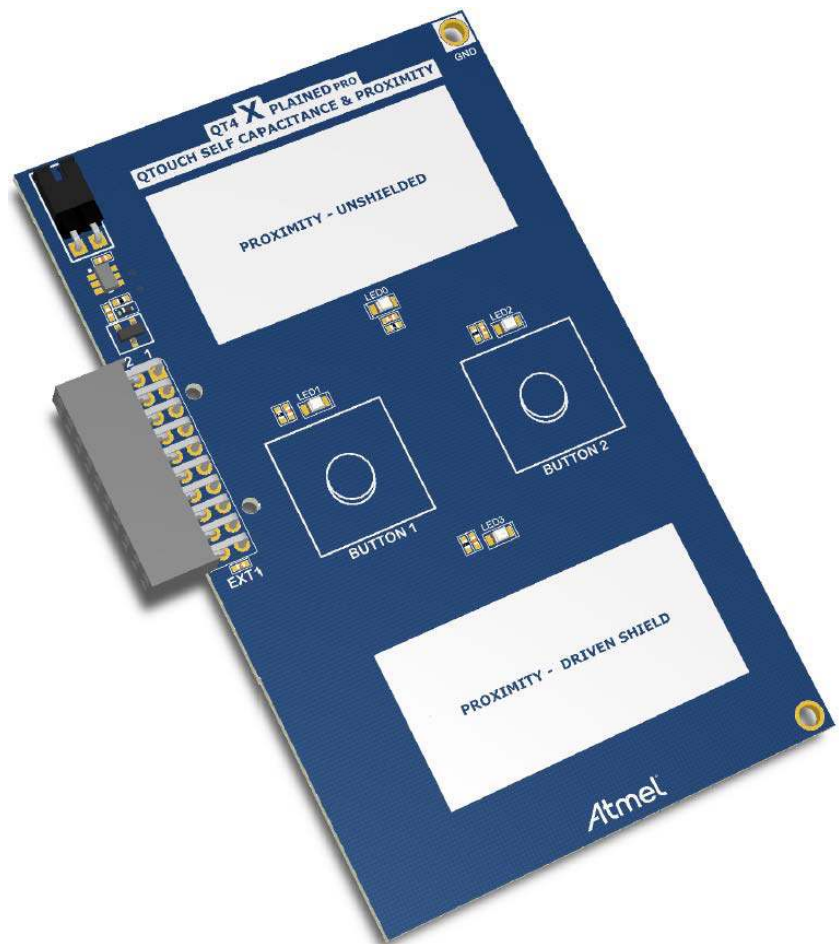
Figure 1. QT4 Xplained Pro

Atmel® QT4 Xplained Pro kit is an extension board that enables evaluation of self-capacitance mode proximity and touch using the peripheral touch controller (PTC) module. The kit shows how easy it is to design a capacitive touch board solution for the PTC without the need for any external components.