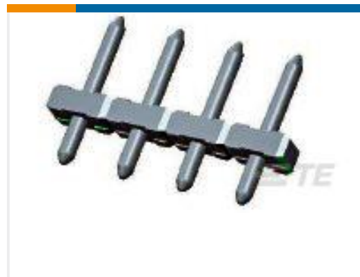
TE Part #1-282832-3 TERMI-BLOK PIN HEADER 5MM STAC