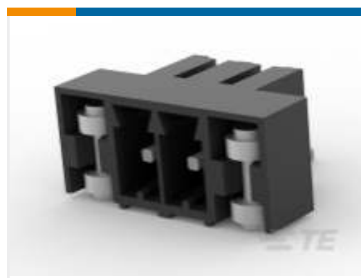
TE Part #2213933-2 SMT TB R/A HEADER, RET, 3.5MM, 2 POS