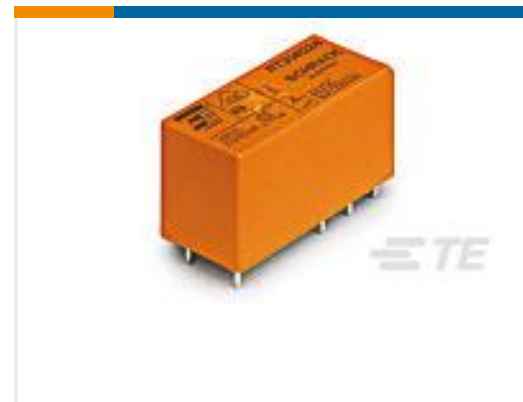
TE Part #5-1393238-7 RTD14F03