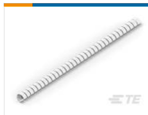
TE Part #142840-2 TUBING SPIRAP 500030-2