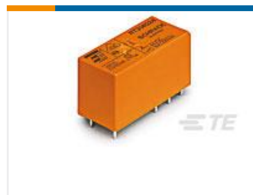
TE Part #8-1393239-4 RTD14F03