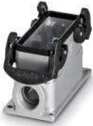
HEAVYCON box mounting base B24, with double locking latch, height 67 mm, with support 1xM25

Please be informed that the data shown in this PDF Document is generated from our Online Catalog. Please find the complete data in the user's documentation. Our General Terms of Use for Downloads are valid ( http://phoenixcontact.com/download )