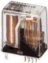
KAMMRELAIS ®, contact B 110, size 2, low-level contact, 4 PDTs, input voltage 230 V AC

Please be informed that the data shown in this PDF Document is generated from our Online Catalog. Please find the complete data in the user's documentation. Our General Terms of Use for Downloads are valid ( http://phoenixcontact.com/download )