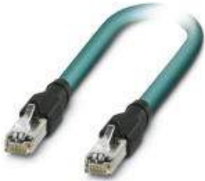
Patch cable, CAT5e, 4-pair, shielded, line, assembled with straight RJ45/IP20 heads at both ends, length: 10 m

Please be informed that the data shown in this PDF Document is generated from our Online Catalog. Please find the complete data in the user's documentation. Our General Terms of Use for Downloads are valid ( http://phoenixcontact.com/download )