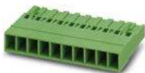
The illustration shows a 15-position version

Please be informed that the data shown in this PDF Document is generated from our Online Catalog. Please find the complete data in the user's documentation. Our General Terms of Use for Downloads are valid ( http://download.phoenixcontact.com )