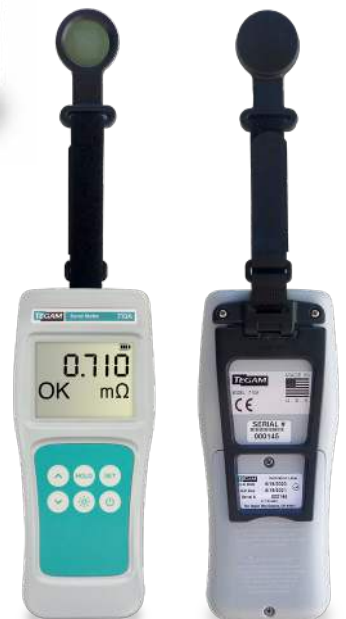
Tilt Stand/Magnet/ Carrying Strap