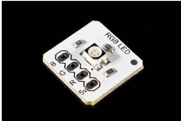
RGB LED Breakout (3528)