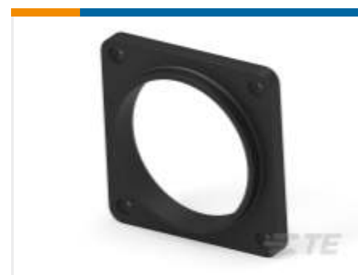
TE Part # 207299-4 FLANGE PLUG