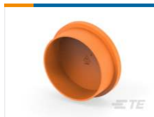
TE Part # 6-2407269-1 CAP, CPC, SIZE 23 RECP, ORANGE