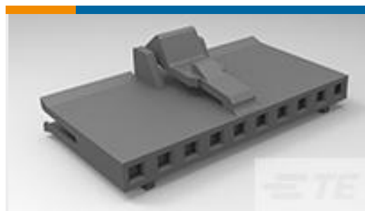
TE Part #1-487526-1 012 HOUSING FFC RCPT 100CL SR