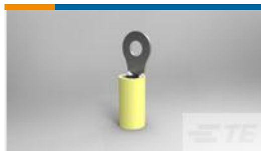
TE Part #8-35108-1 TERMINAL,PIDG R 12-10 8