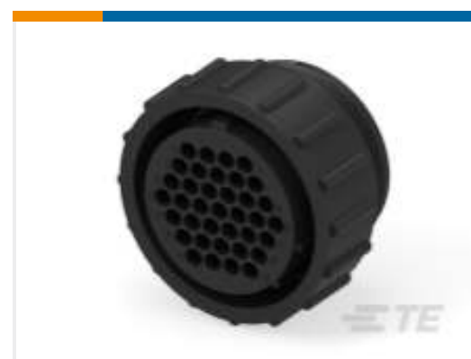
TE Part # 206150-1 CPC PLUG ASSEMBLY SIZE 23-37