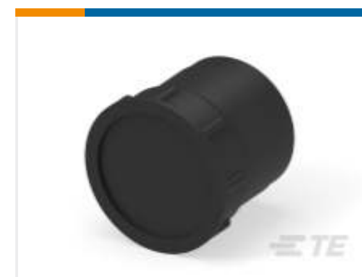
TE Part # 207055-1 EXTENDER BACK SHELL