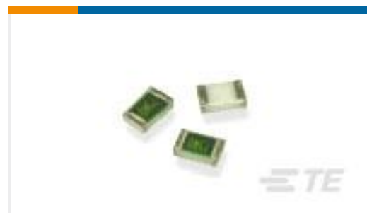
TE Part #3-2176089-4 RP 1J 0.166W 24K9 0.1% 25PPM 1K RL