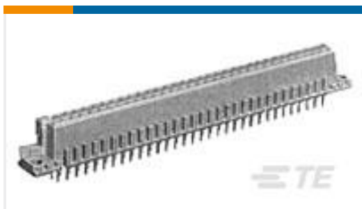
TE Part #5536446-5 ASSEMBLY,RECEPTACLE,EUROCARD, T