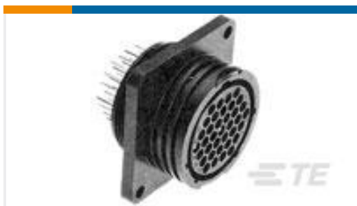
TE Part #2-208224-1 CPC RECPT ASSEMBLY SIZE 23-37