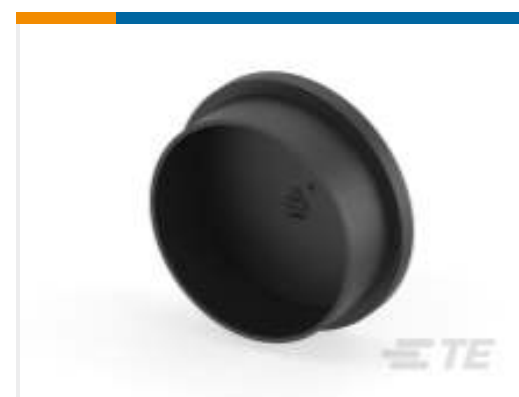
TE Part # 6-2407269-2 CAP, CPC, SIZE 23 RECP, BLACK