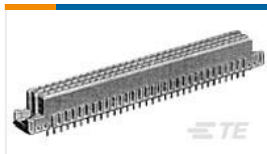
TE Part #5650956-5 ASSEMBLY,RECEPTACLE,EURO,TYPE