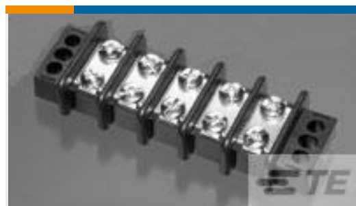
TE Part #1546310-4 4P .563" DR BARRIER STRIP