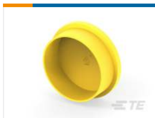
TE Part # 6-2407269-4 CAP, CPC, SIZE 23 RECP, YELLOW