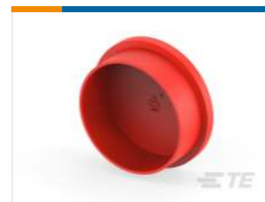
TE Part # 6-2407269-3 CAP, CPC, SIZE 23 RECP, RED