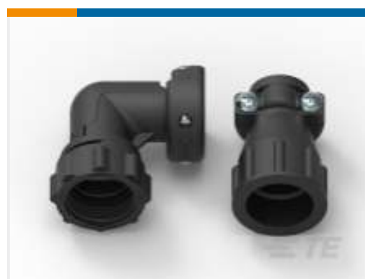
TE Part # CAT-AM71-C83998B CPC Cable Clamps