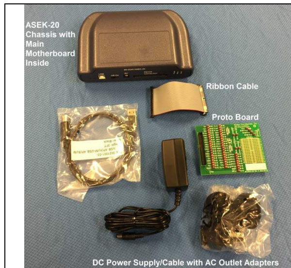
Figure 1. ASEK 20 Kit