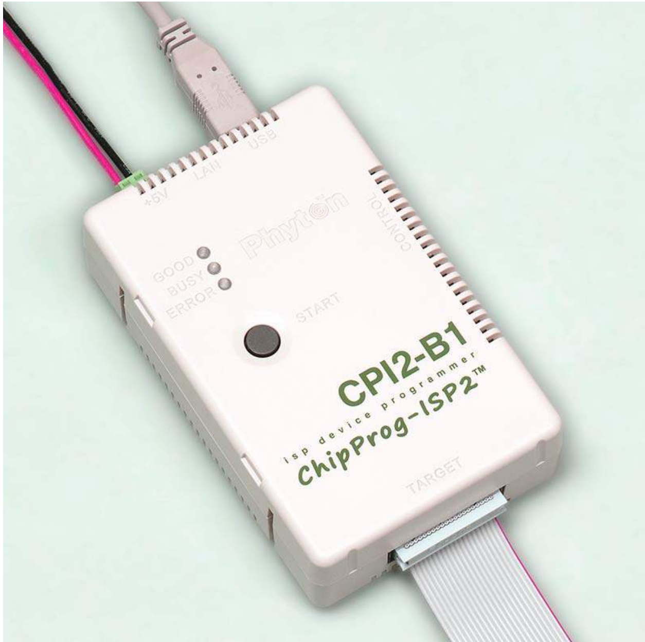
CPI2-B1-TIC2K – universal programmer