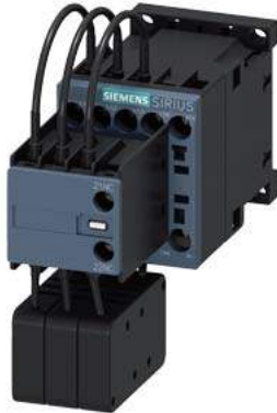
Capacitor contactor, AC-6b 12.5 kVAR, / 400 V 2 NC, 110 V DC 3-pole, Size S00 screw terminal