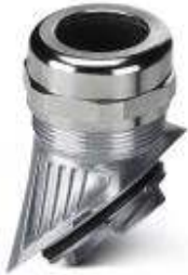
EVO metal cable gland with bayonet locking; size M40, with filler plug

Please be informed that the data shown in this PDF Document is generated from our Online Catalog. Please find the complete data in the user's documentation. Our General Terms of Use for Downloads are valid ( http://phoenixcontact.com/download )