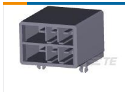
TE Part #1-178140-5 DYNAMIC D3200 HDR V ASSY 6P