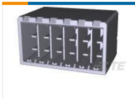
TE Part #316516-5 DYNAMIC 3500 HDR ASSY 12P V