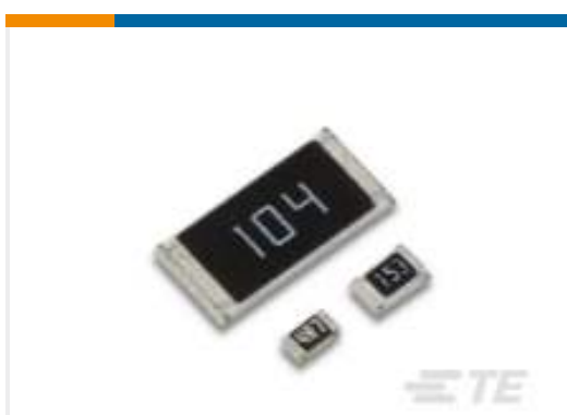
TE Part #4-2176337-5 CRGCQ 0402 47K 1%