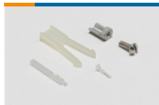
PCB Connector Keying(1)