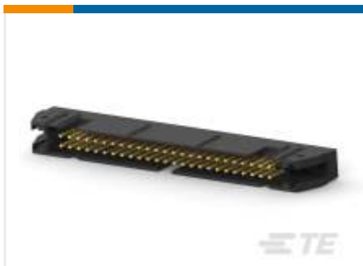
TE Part #5499922-9 AMP-LATCH UNIVERSAL HEADERS