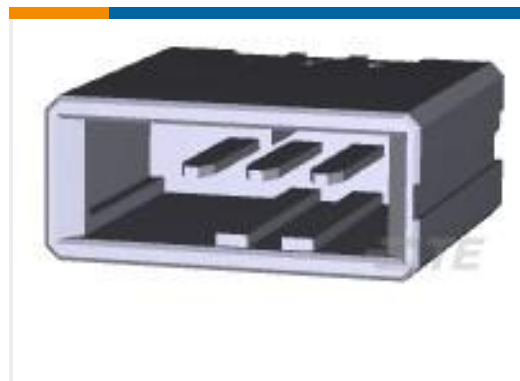
TE Part #1-178313-5 DYNAMIC D3100 HDR V 3P ASSY