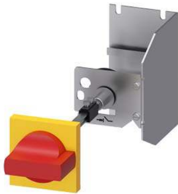
Door-coupling rotary operating mechanism for circuit breaker Size S00/S0 Handle emergency switching-off new design