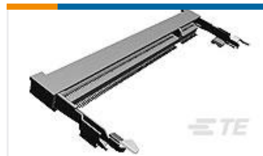
TE Part #1565917-4 EMBOSS ASSY DDR2 SODIMM SOCKET 200P 5.2H