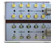
LED Strip Lighting