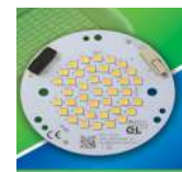
LED Down Lighting