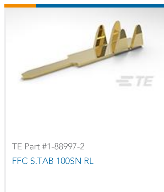
TE Part #1-88997-2 FFC S.TAB 100SN RL