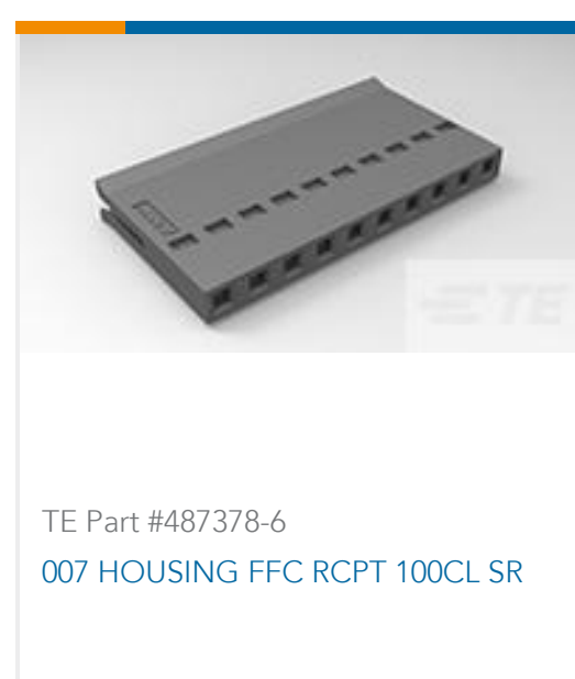
TE Part #487378-6 007 HOUSING FFC RCPT 100CL SR