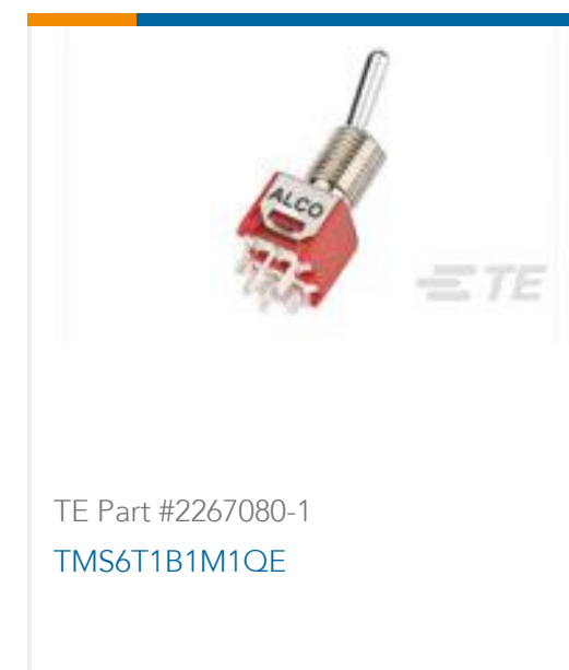
TE Part #2267080-1 TMS6T1B1M1QE