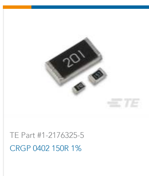
TE Part #1-2176325-5 CRGP 0402 150R 1%