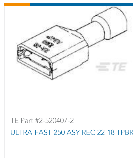
TE Part #2-520407-2 ULTRA-FAST 250 ASY REC 22-18 TPBR