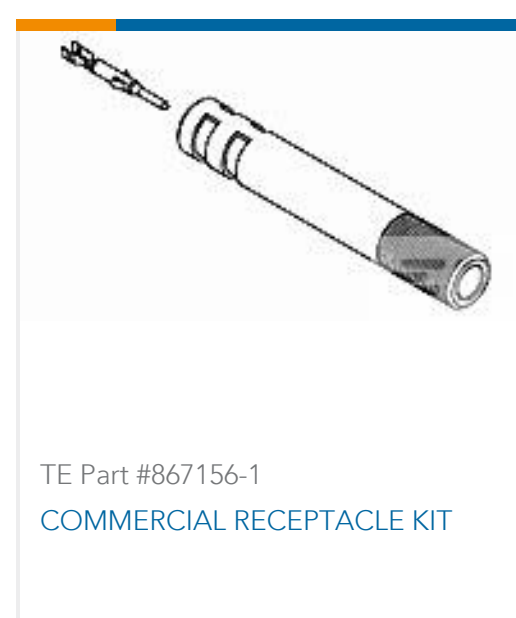
TE Part #867156-1 COMMERCIAL RECEPTACLE KIT