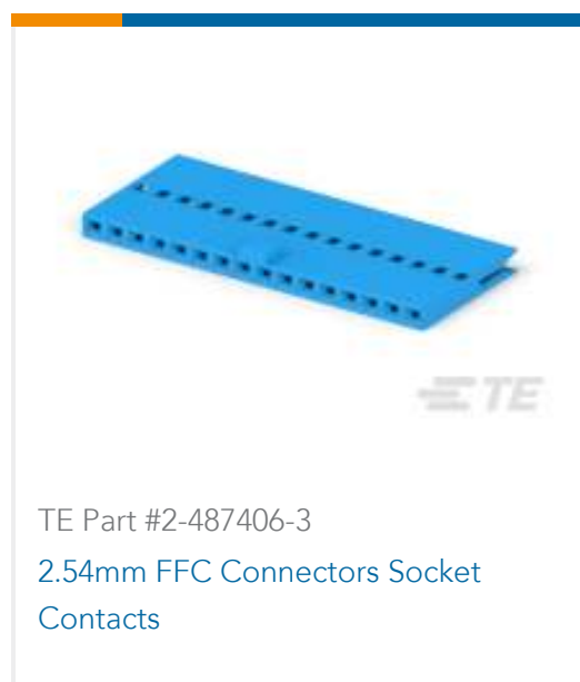
TE Part #2-487406-3 2.54mm FFC Connectors Socket Contacts