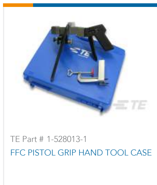
TE Part # 1-528013-1 FFC PISTOL GRIP HAND TOOL CASE