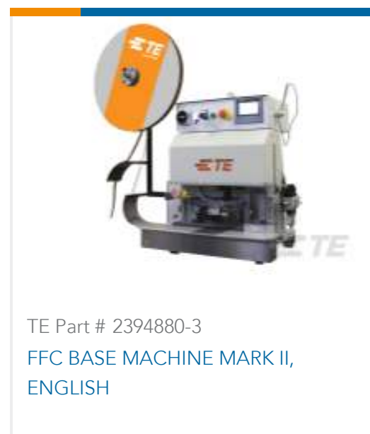
TE Part # 2394880-3 FFC BASE MACHINE MARK II, ENGLISH