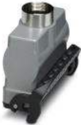
HEAVYCON B24 coupling housing, with single locking latch, height: 80.5 mm, with 1 x M32 gland, straight cable outlet

Please be informed that the data shown in this PDF Document is generated from our Online Catalog. Please find the complete data in the user's documentation. Our General Terms of Use for Downloads are valid ( http://download.phoenixcontact.com )