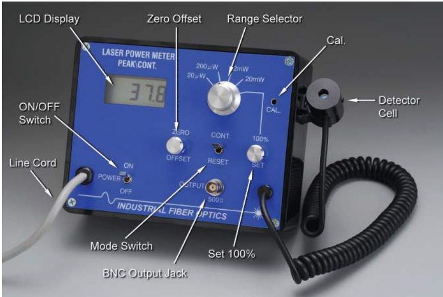
Figure 2. Front view of digital power meter.

Becoming familiar with the features of the digital laser power meter will help when operating the unit. The following illustration and list explain the pertinent parts.