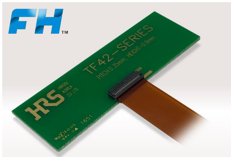
FH Flip-Lock Pioneer Hirose