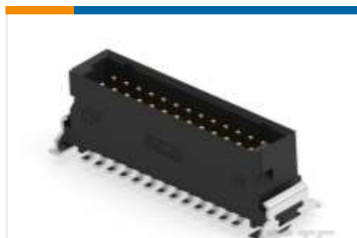
TE Part #244837-E SMCQ 26 M AB VV 8-13 CL * H007 137 E005