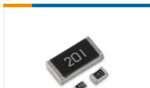
TE Part #3-2176326-5 CRGP 0603 6K8 1%