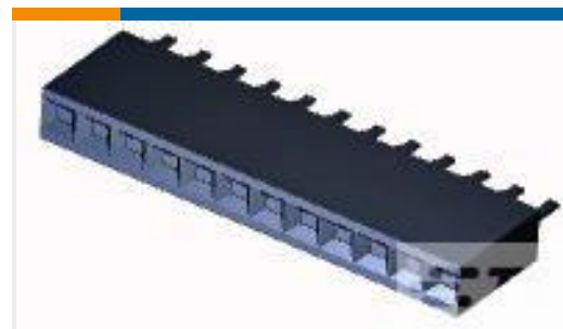
TE Part #1-534237-0 12 MODII VRT SR CE 100/115