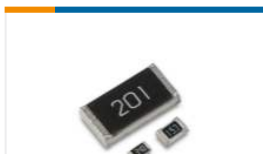
TE Part #2-2176326-9 CRGP 0603 2K2 1%