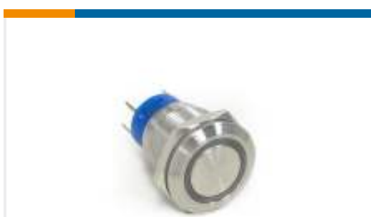
TE Part #1-2213764-7 AV19 SPM 5A FIX RING LED BLUE 12V