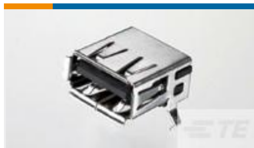
TE Part #292303-3 Std USB Type A, R/A, T/H, Natural