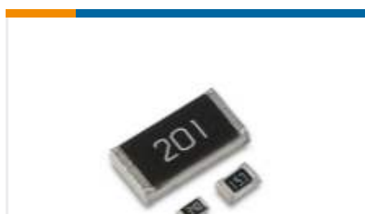
TE Part #2-2176326-7 CRGP 0603 1K5 1%