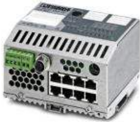
Ethernet Smart Managed Compact Switch with eight 10/100 Mbps RJ45 ports, PROFINET mode (default)

Please be informed that the data shown in this PDF Document is generated from our Online Catalog. Please find the complete data in the user's documentation. Our General Terms of Use for Downloads are valid ( http://phoenixcontact.com/download )