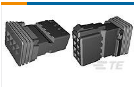
TE Part #9-965382-2 8POS MQS REC COD Z