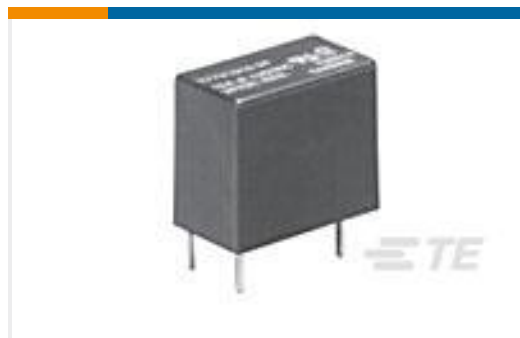
TE Part #2-1393194-6 T77V1D3-12