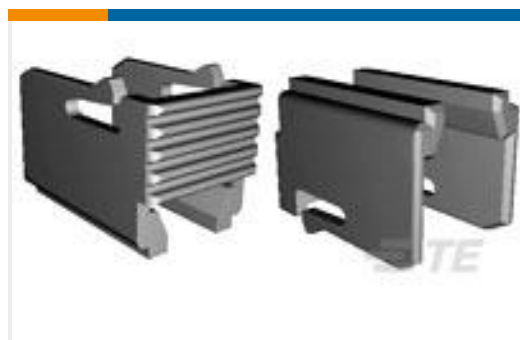
TE Part #965383-1 MQS SICHERGSCHIEBER 8POS