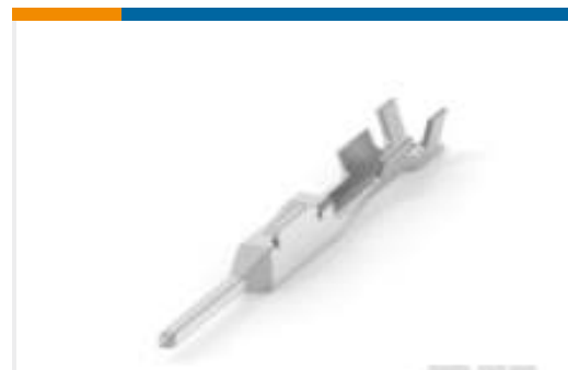
TE Part #1802190-1 TAB0.64X0.64,TERMINAL