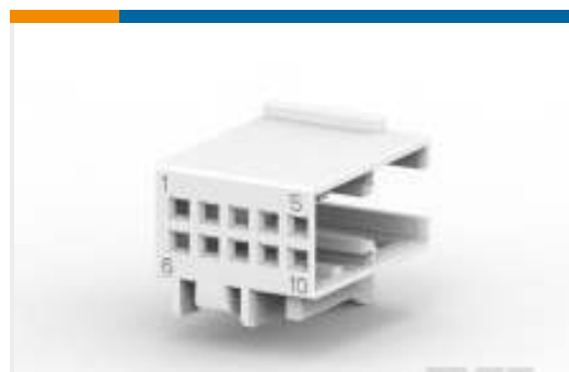
TE Part #2-2177198-1 COVER,10 POS. MQS,NA