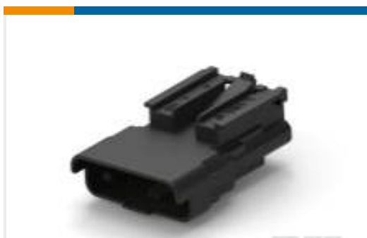
TE Part #953657-4 5W TAB HSG ASSY