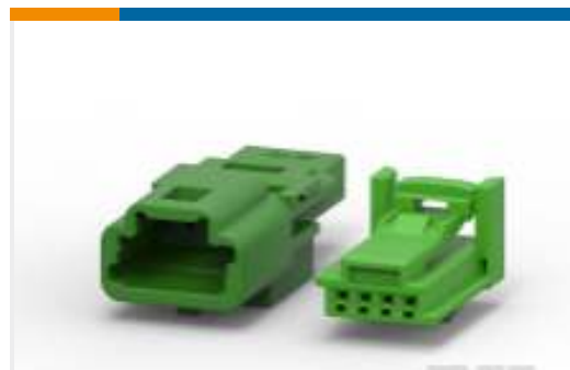
TE Part #1379662-2 TH/.025 CONNECTOR SYSTEM, HOUSING