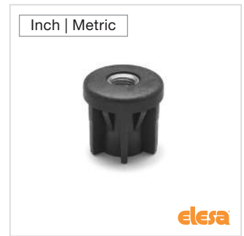
ELESA original design NDX.T