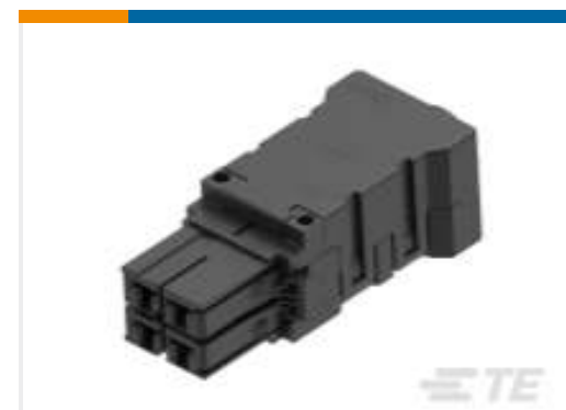
TE Part #1971239-1 D5200 REC CABLE CLAMP 4P(2ROW) KIT X-X