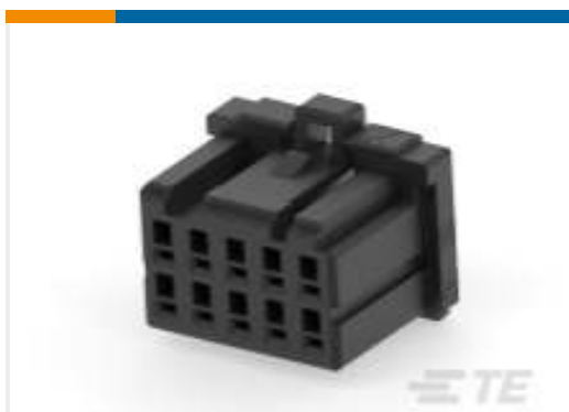
TE Part #1-2069829-4 Receptacle and Tab Housing: 2.5 mm Pitch, 250V