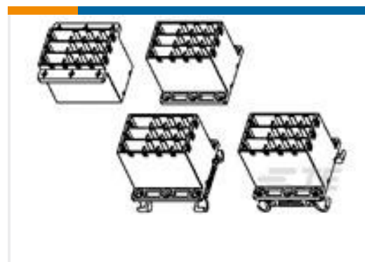
TE Part #1903146-1 DYNAMIC D-5 DYNATAP 12P ASSY P /M FRONT