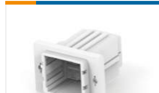
TE Part #1-2040021-3 Receptacle and Tab Housing: 5.08 or 10.16 mm pitch, 250-600V