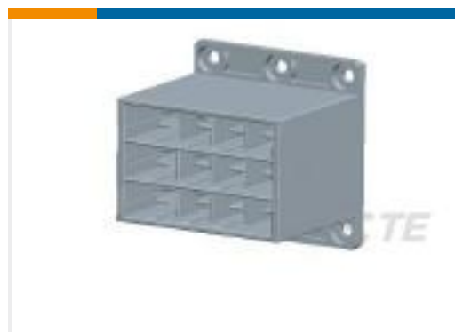
TE Part #1903146-2 DYNAMIC D-5 DYNATAP 12P ASSY P /M BOTTOM