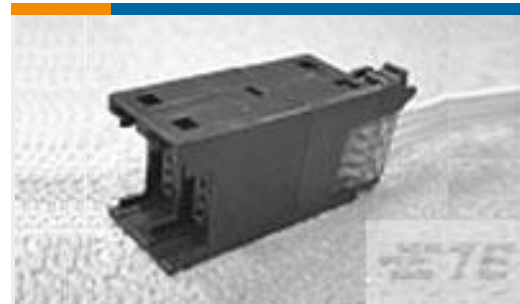
TE Part #1473574-3 RITS.JUNCTION BOX 4D 3P P/M