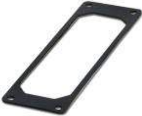
The illustration shows version HC-B 24-FL-DI

Replacement flange seal, for HEAVYCON panel mounting base type D25, self-adhesive, color: Black