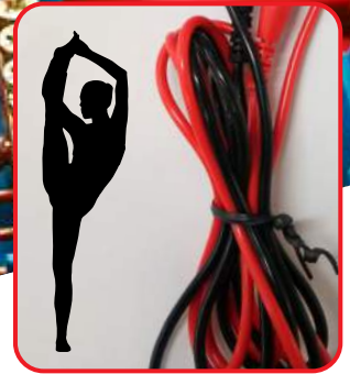
Fully Flexible Silicon Test Leads