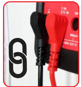
4 mm spring engagement for Firm Connection