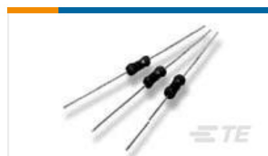
TE Part #4-1879350-2 RR01 5% 11R AMMO