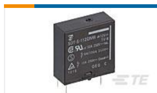
TE Part #8-1419125-5 SDT-S-106LMR,000