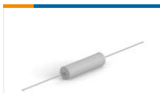
TE Part #4-2176414-8 7W STD M/OX 5% 1K8