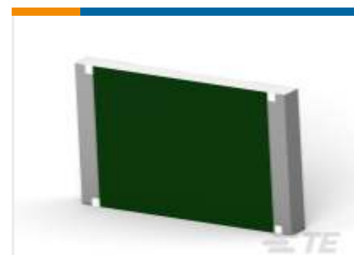
TE Part #8-2176407-8 3560 27R 5%