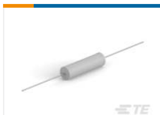
TE Part #4-2176414-8 7W STD M/OX 5% 1K8