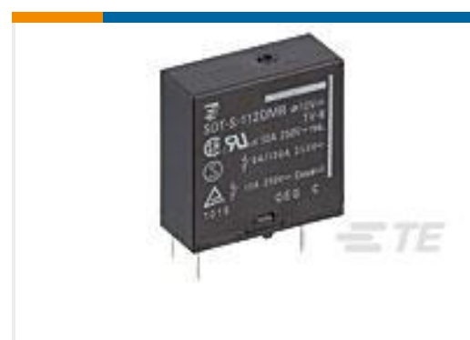
TE Part #8-1419125-5 SDT-S-106LMR,000