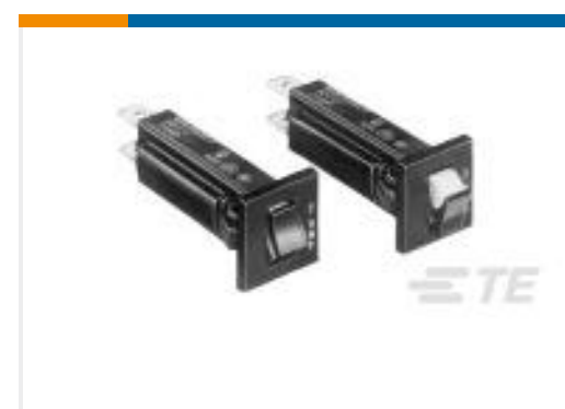
TE Part #1-1393250-7 W28-XQAT-15=W28