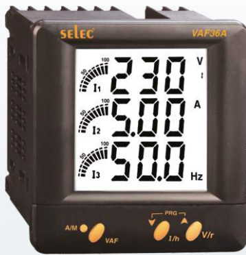
96 X 96mm