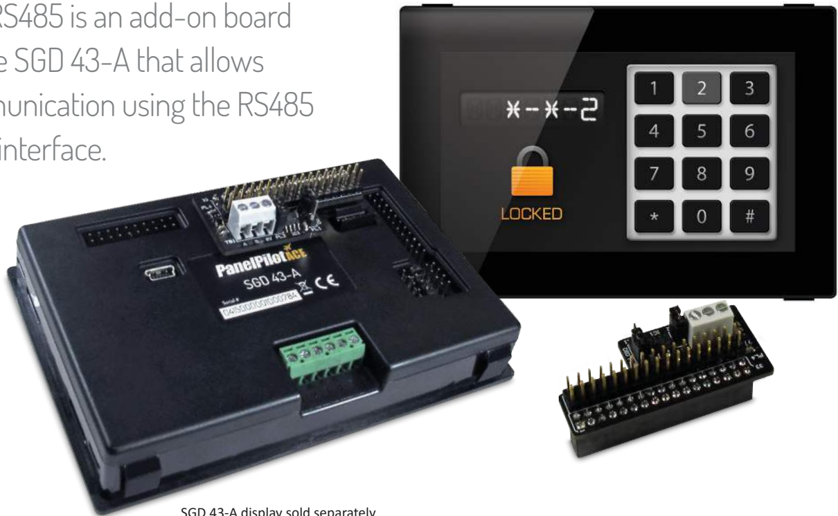
SGD 43-A display sold separately

S43-RS485 is an add-on board for the SGD 43-A that allows communication using the RS485 serial interface.