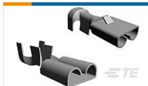
TE Part #160655-4 FF 110 REC TERMINAL 20-15 AWG PTPPB