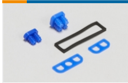
Rectangular Connector Seals(1)