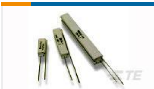
TE Part #1-1623728-1 BCHE 11 W 220R 5%