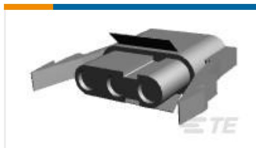
TE Part #1-163038-0 03P M-N-L.SOCK.HSG.