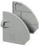
Flange cover, Color: gray