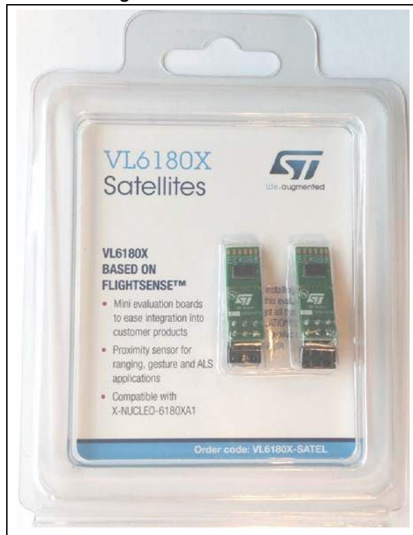
Figure 3. VL6180X-SATEL

Note: VL6180X satellite boards can be ordered under the reference: VL6180X-SATEL.