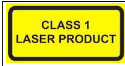
Figure 4. Class 1 laser product label

The VL6180X contains a laser emitter and corresponding drive circuitry. The laser output is designed to remain within Class 1 laser safety limits under all reasonably foreseeable conditions including single faults in compliance with IEC 60825-1:2007. The laser output will remain within Class 1 limits as long as the STMicroelectronics recommended device settings are used and the operating conditions specified in the datasheet are respected. The laser output power must not be increased by any means and no optics should be used with the intention of focusing the laser beam.