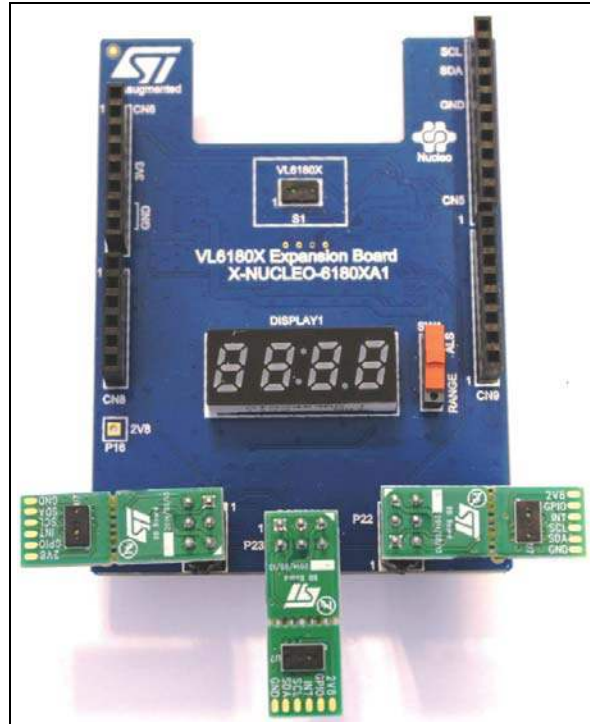
Figure 2. Connections of VL6180X satellite boards

Note: VL6180X satellite boards can be ordered under the reference: VL6180X-SATEL.