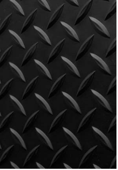
Corrugated Embossed Pattern