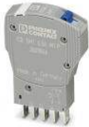
Thermomagnetic device circuit breaker, 1-pos., tripping characteristic M1 (medium-blow), 1 PDT contact, plug for base element.

Please be informed that the data shown in this PDF Document is generated from our Online Catalog. Please find the complete data in the user's documentation. Our General Terms of Use for Downloads are valid ( http://download.phoenixcontact.com )