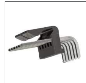
KK® 396 RPC Vertical and Right-Angle Headers with Friction Lock