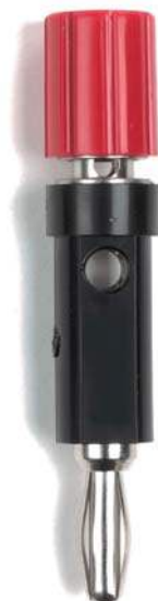
Model 2894 Binding Post to Single Banana Plug