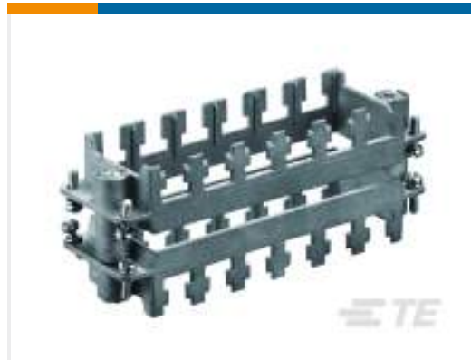
TE Part #T2070244001-000 H24BN-T6