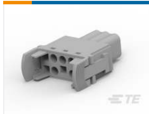
TE Part #T2110052201-000 HMN-005-FS