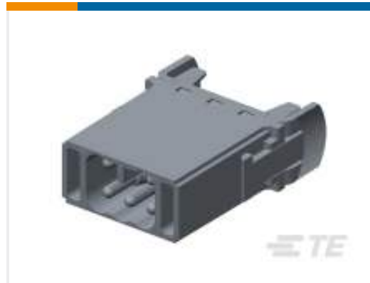
TE Part #T2110052101-000 HMN-005-MS