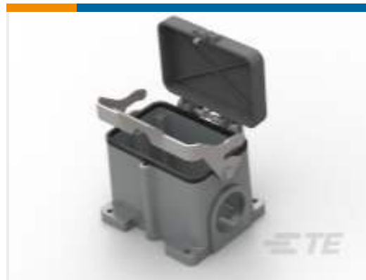
TE Part #T1620480132-000 H48B-SDR-LB-M32