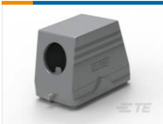
TE Part #T1310480132-000 H48B-TS-RO-M32