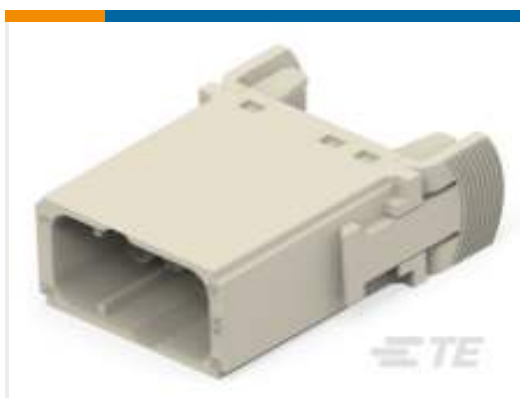
TE Part #T2111082001-T00 HMN-008-M