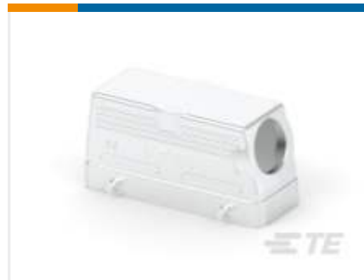
TE Part #T1210244132-000 H24B-TS-M32