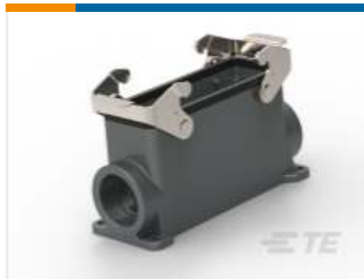
TE Part #T1470242132-000 H24B-SGRH-M32